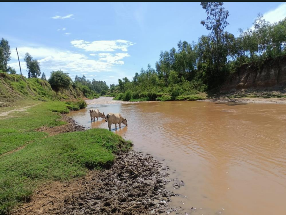
old water source