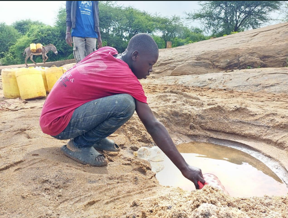
old water source